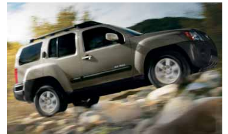
The new Xterra will be a favourite of customers who are free spirited.

This vehicle is aimed at adding adventure and