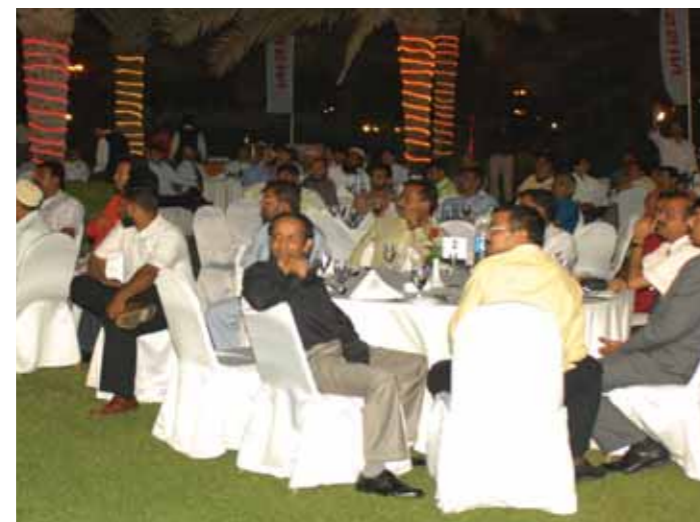
Guests enjoy the annual Spare Parts Dealer meeting.

The evening's entertainment included a quiz show with the event brought to a close with a raffle.